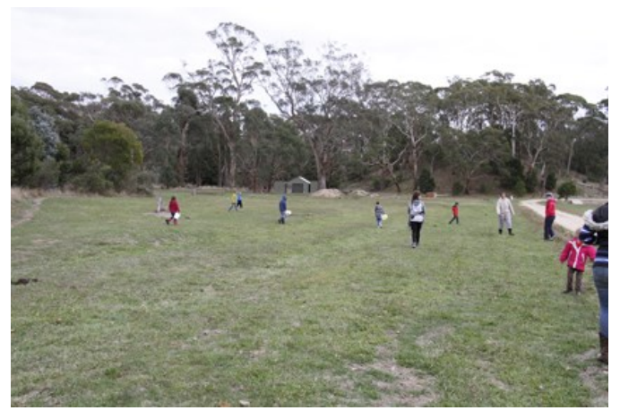
Sunday egg hunt