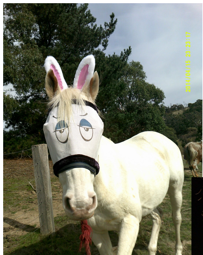
Even the horses were in the spirit