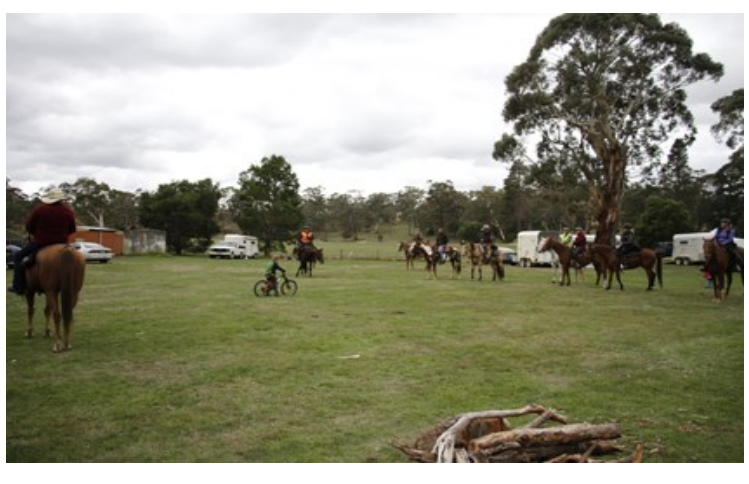
Happy Birthday to Tom