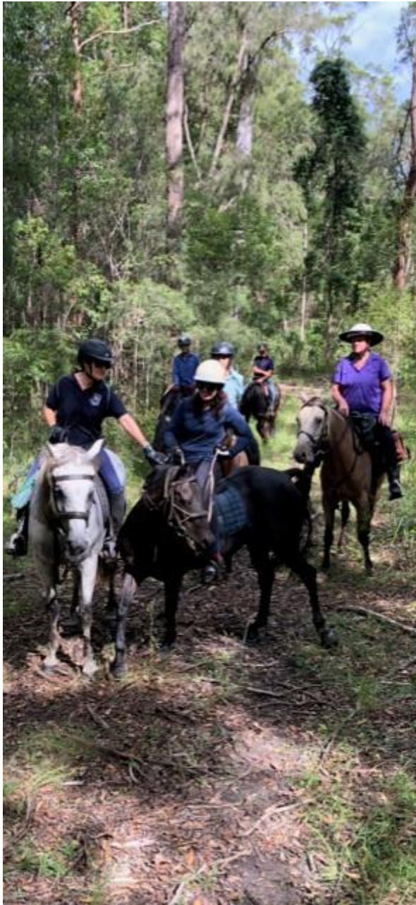
Riders on the trail