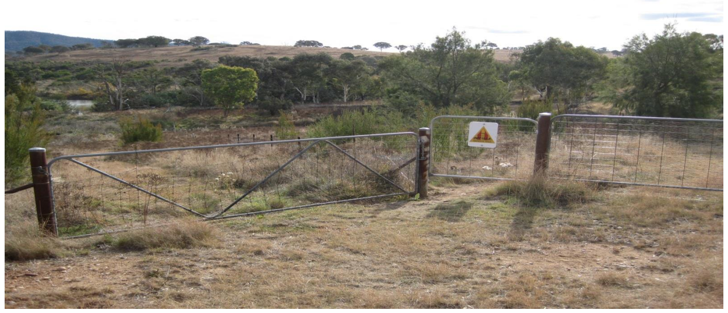
overlooks the Murrumbidgee and the Bullen Ranges. Zig Zags to avoid the archery range.