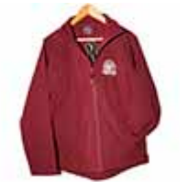
Shower proof Layered Jacket $85.00