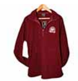
Polar fleece Top Short Zip $50.00