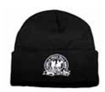
Woollen Beanie $10.00