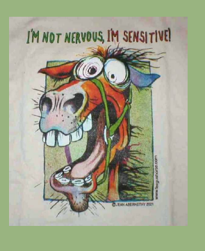
No hour of life is wasted that is spent in the saddle. ~Winston Churchill