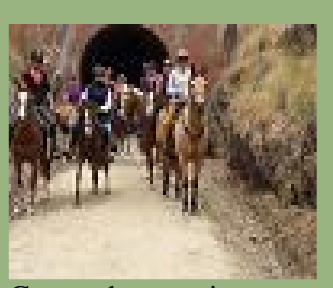
Group shot coming through the Cheviot tunnel