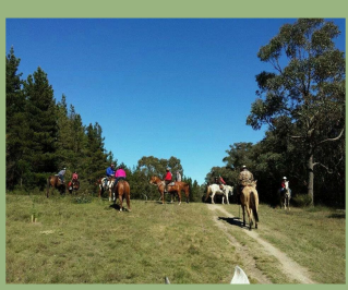
Group shot, with pretty blue skies.

Well what a fantastic day we all had, the weather was fantastic (considering it was Macedon we were very excited to see blue skies.)