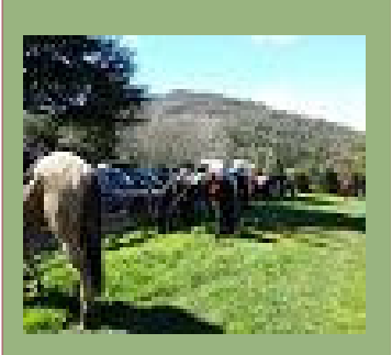
Heading up the mountain