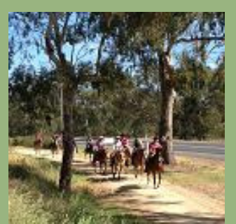
Just about to cross the hwy