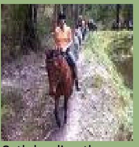
Cath leading the way