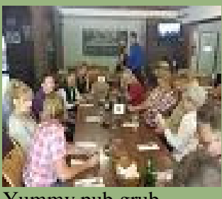
Yummy pub grub