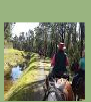
Riding along the aquaduct